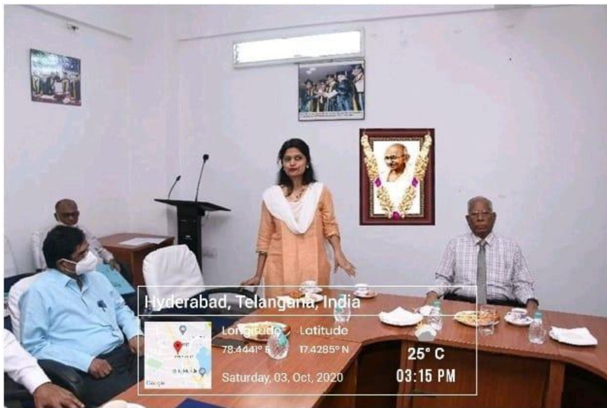
Mahathma Gandhi Jayanthi on 3 rd October 2020

Muffakham Jah College of Engineering and Technology has celebrated Mahatma Gandhi Jayanthi in our college campus on 02nd October, 2020. All the HODs, faculty and non teaching staff have participated. Students of our institution enthusiastically take part in the Gandhi Jayanthi event celebrations. This day is also celebrated as International Peace Day all across the world. Students sing a song based on the truth and non-violence message of Bapu.