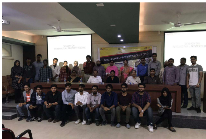
A group photo of Guest Speaker and IIC-MJ Team

The seminar was an overall successful event, which ended with a question and answer session. It was a very informative event for every budding entrepreneur to know in detail all about patent, trademark and copyright, and how it protects their products and ideas which is an essential step in building any startup.